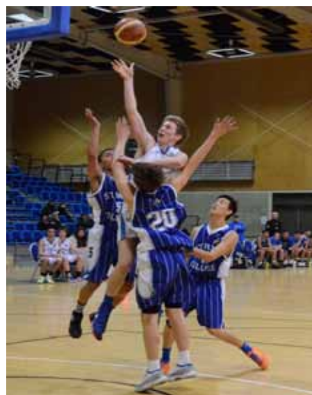
Premier 1 Basketball Final vs Town