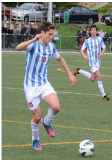
Premier 1 Football Final vs Wellington College