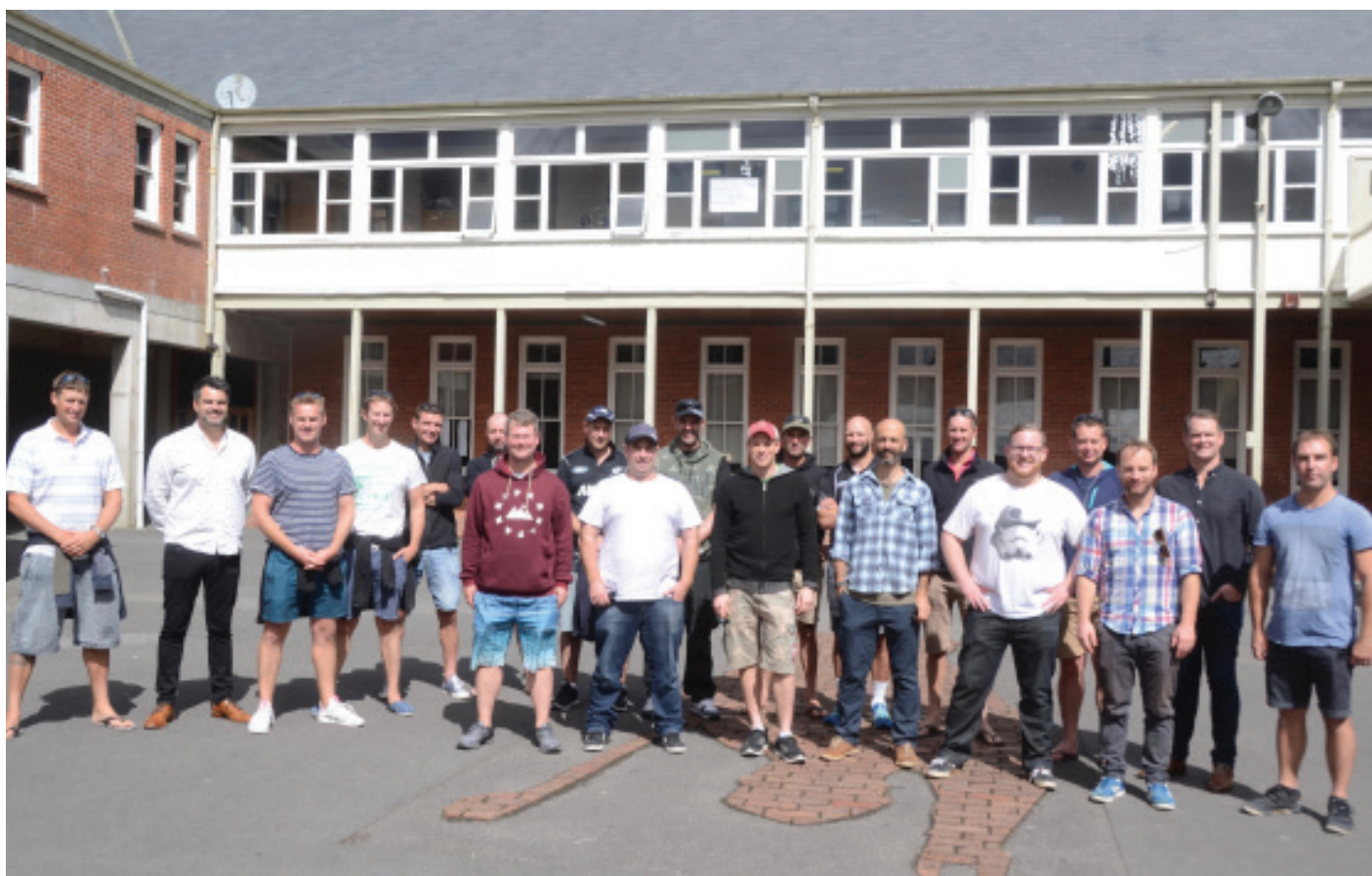
Attendees 1994-98 Reunion