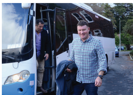
Phil Mickleson, stepping back in time