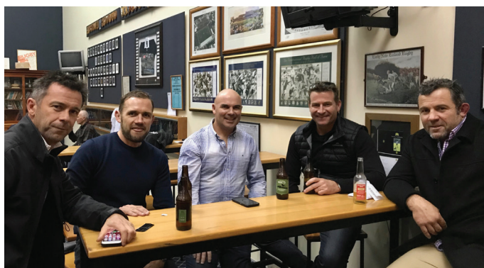
Drinks in the Centurion Bar before AB's v French test