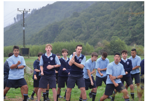
Current students performing the haka at the unveiling of the pou

A pou ra`hui, or carved post, set into a stream bank in 2015 has been joined by a mate to stand guard over an ecological restoration project in Upper Hutt. Hato Pe`tera (St Peter) was unveiled in a ceremony on February 28 and joins Hato Pa`tariki (St Patrick) to mark the boundary of a “no-take zone” on the Ma`waiha`kona Stream.