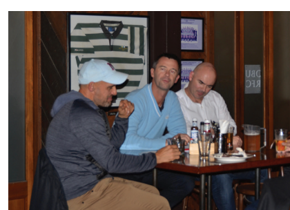
Quiz night at the Cambridge